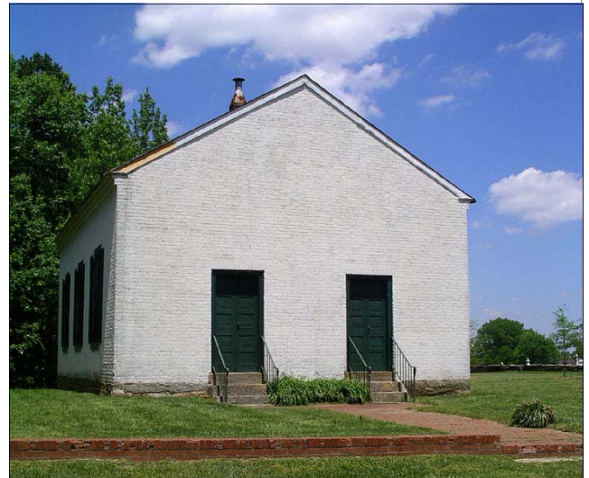
Machpelah Church—Lincoln County 1848