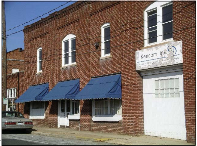
132 Center Avenue, Mooresville The Mooresville Museum is on the way!

The Mooresville Museum is a nonprofit, local organization dedicated to the preservation of regional history and public interests. It is a grassroots endeavor that combines personal, public and private collaboration for the benefit of providing the public with a tangible repository of items and artifacts of local significance. Public education is a major focus of the efforts of the Mooresville museum.